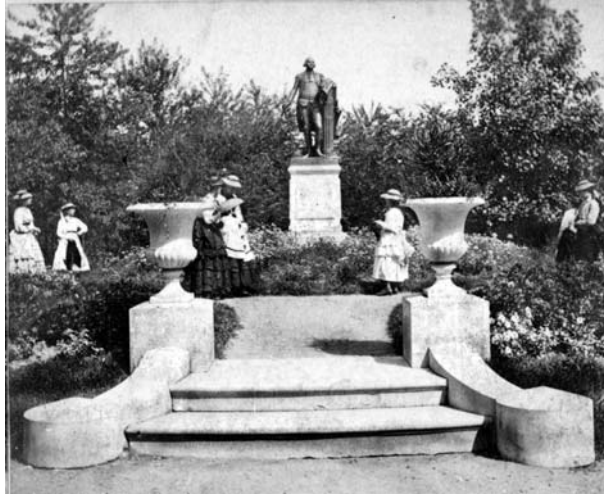
Boehl & Koenig view 194: Washington Statue, courtesy of Missouri Botanical Garden Archives