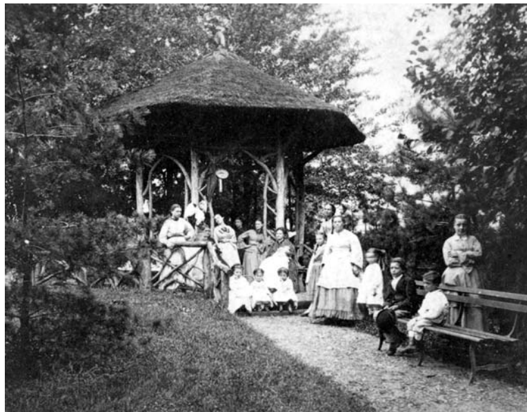
Boehl & Koenig view 190: Summer House above Grotto

3 The ELIZABETH COOK PAVILION is the third one built on this site. The original rustic "summer cottage" had a thatched roof. Although it survived the 1876 Cyclone, it was replaced with a pavilion similar to the current one, except the roof had red clay tiles.