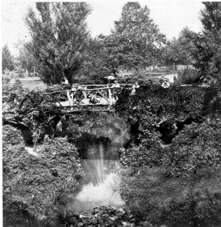
Boehl & Koenig view 189: Rustic Bridge from the west side, courtesy of Missouri Botanical Garden Archives.

15 The PLAYGROUND features turtle and frog sculptures by Robert Cassilly.