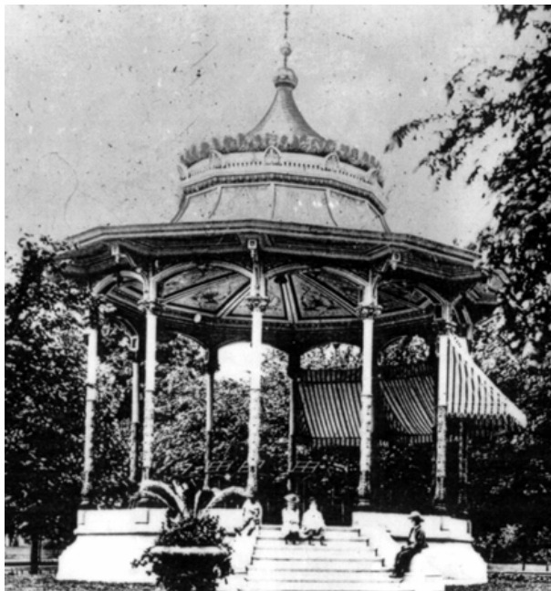
Boehl & Koenig's view 191: Musician's Stand