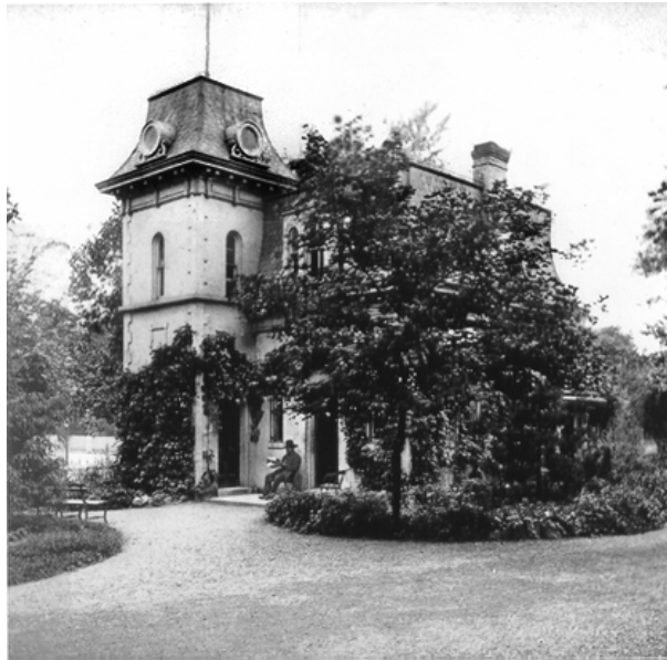
Boehl & Koenig view 193: The Police Station, currently known as the Park House, courtesy of the Missouri Botanical Garden Archives

1 The PARK HOUSE was built in 1867 for use as a police station. It was enlarged in 1870. Currently the building houses an office for the Lafayette Square Restoration Committee and a St. Louis Police substation.