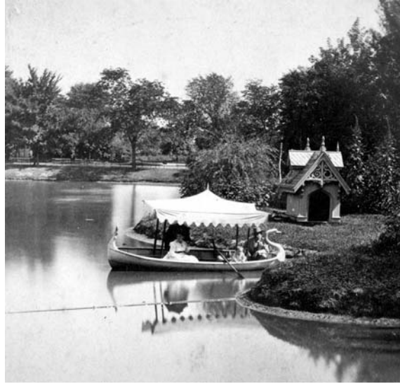
Benecke view of main lake with swan house and swan boat, courtesy of Missouri Botanical Garden archives

6 Victorians rode around the MAIN LAKE in swan boats. The current swan house and fountain are reproductions of the Victorian originals.