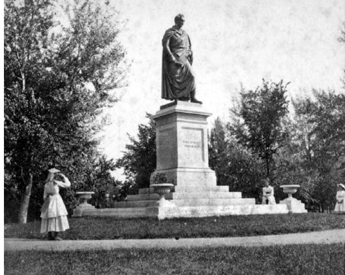
Boehl & Koenig view 194: Benton Statue, courtesy of Missouri Botanical Garden Archives

9 The THOMAS HART BENTON statue by Harriet Hosmer was dedicated in 1868. It was the first public monument in the state of Missouri.