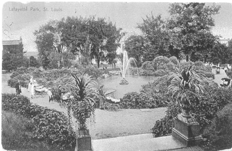
Postcard of the west lake with buildings along Missouri Avenue in the background

10 A garden grows amidst BLOSSOM ROCK that once defined the edge of a lake containing three fountains and a waterfall.